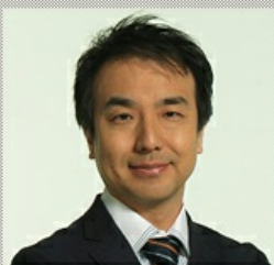
NIKKEI EDITORIAL WRITER YASUHIRO OTA