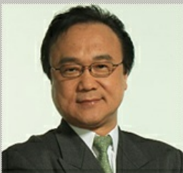
NIKKEI EDITORIAL WRITER WAICHI SEKIGUCHI